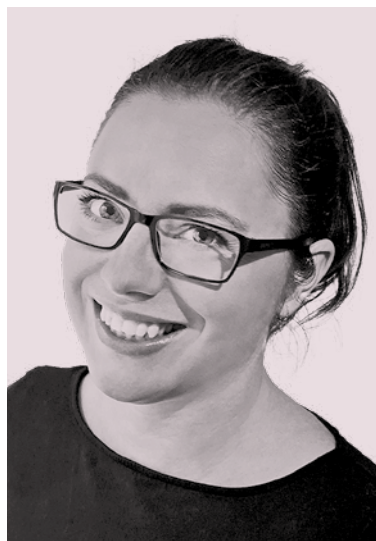
KRISTÝNA TMEJOVÁ Forbes Next Editor-in-Chief